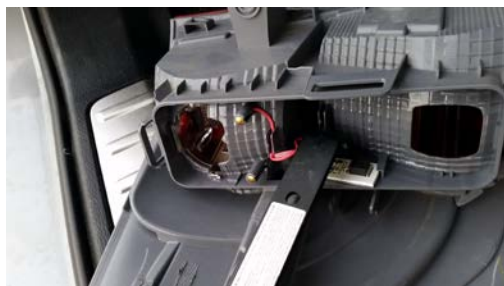
Small pry bar used to lever circuit board loose on fender light assy. Tailgate assembly requires heat stake to be broken for board removal.

- Tailgate: Follow instructions for replacing back up lamps. Remove covers on either side of tailgate trim panel. White panel clips will be immediately visible. Remove small torx screws in bottom of handle wells and set aside. Use a trim tool to release the panel clips from the tail gate at the tail light assemblies. Pull tail gate trim panel down starting at one corner and working around the panel. Caution! Do not let trim panel fall if auto closing option is installed. Disconnect plug from tail gate button and set trim panel aside. Locate any panel clips that may have become dislodged and reseat them in the panel. Remove light assembly by backing off the single 8mm nut on retention block toward the inside of the tailgate. Remove the block, the nut is captive. Push the tail light assembly out of the tailgate. The gasket may require some amount of force to release. The circuit board is immediately visible and can be tested for function.